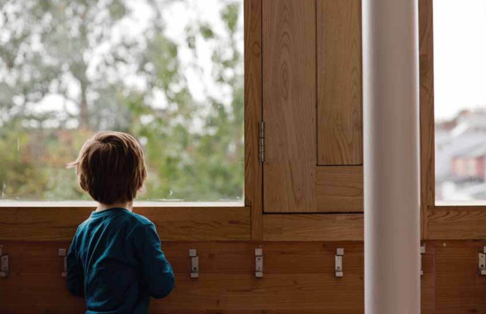
Inchicore National School. Donaghy & Dimond Architects. Photographer: Ste Murray