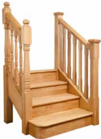
Timbmet can supply all components to produce a bespoke Oak staircase.

Timbmet Engineered Components are highly engineered wood products constructed from multi-layer components to combine high performance and aesthetic appeal.