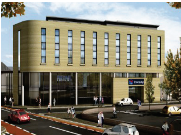
Kempston Travelodge, Lancaster Timber Frame Contractor - Shire Timber Structures Main Contractor - Sisk UK Ltd