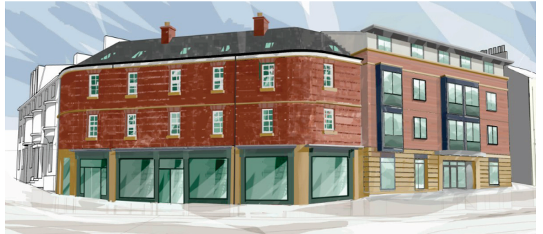
Boothbys - Premier Inn, Scarborough Timber Frame Contractor - Shire Timber Structures Main Contractor - PDR Construction