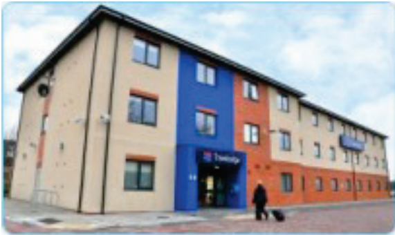
Bromborough Travelodge, Liverpool Timber Frame Contractor - Shire Timber Structures

ARC Engineers have carried out the structural design of timber frames to several hotels in recent years ranging in size and complexity from simple three storey buildings to multi-storey accommodation formed from steel and concrete framed podium substructures